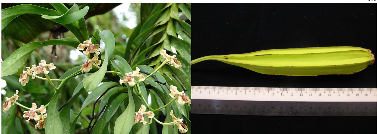
Fig. 1. (a) Flowering plant of Vanda helvola Blume; (b) Orchid capsule