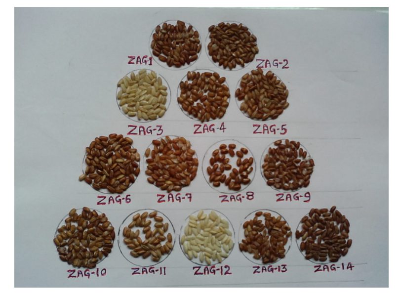
Fig. 1. Variability in pericarp colour intensity among 14 red rice ecotypes from temperate region of Kashmir, India

Phenotypic variance was higher than the genotypic variances for all the characters thus indicated the influences of environmental factor on these. The extent of the environmental influence on any character is indicated by the magnitude of the differences between the genotypic and phenotypic coefficients of variation. Sinha et al. (2004) also observed similar results and concluded that large differences reflect high environmental influence, while small differences reveal high genetic influence. Moderate to low genotypic and phenotypic coefficients of variation obtained for days to 50% flowering, days to maturity, plant height and panicle length these findings are further supported by Iftekharuddeula et al. (2001). The small differences observed between genotypic and phenotypic coefficients.