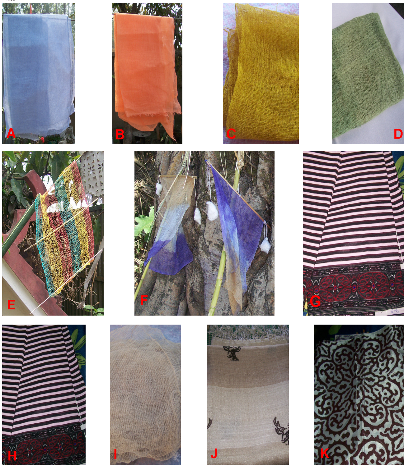
Fig. 3. Different shades and designs of clothes dyed from the ten dye yielding plants

natum ( 675.57 \text{ mg g}^{-1} ), S. flaccifolius ( 648.12 \text{ mg g}^{-1} ) and T. chebula ( 292.24 \text{ mg g}^{-1} ) indicated its use as dyes as tannins are reported to be responsible for various dyes (Shahid et al. , 2009). The fruits of Solanum nigrum were used to dye a cloth worn by the royals in early days known as 'Khamen chatpa' (Fig. 3K). Appreciable quantity of flavonoids in S. nigrum ( 24.89 \text{ mg g}^{-1} ) and T. chebula ( 21.72 \text{ mg g}^{-1} ) corre-