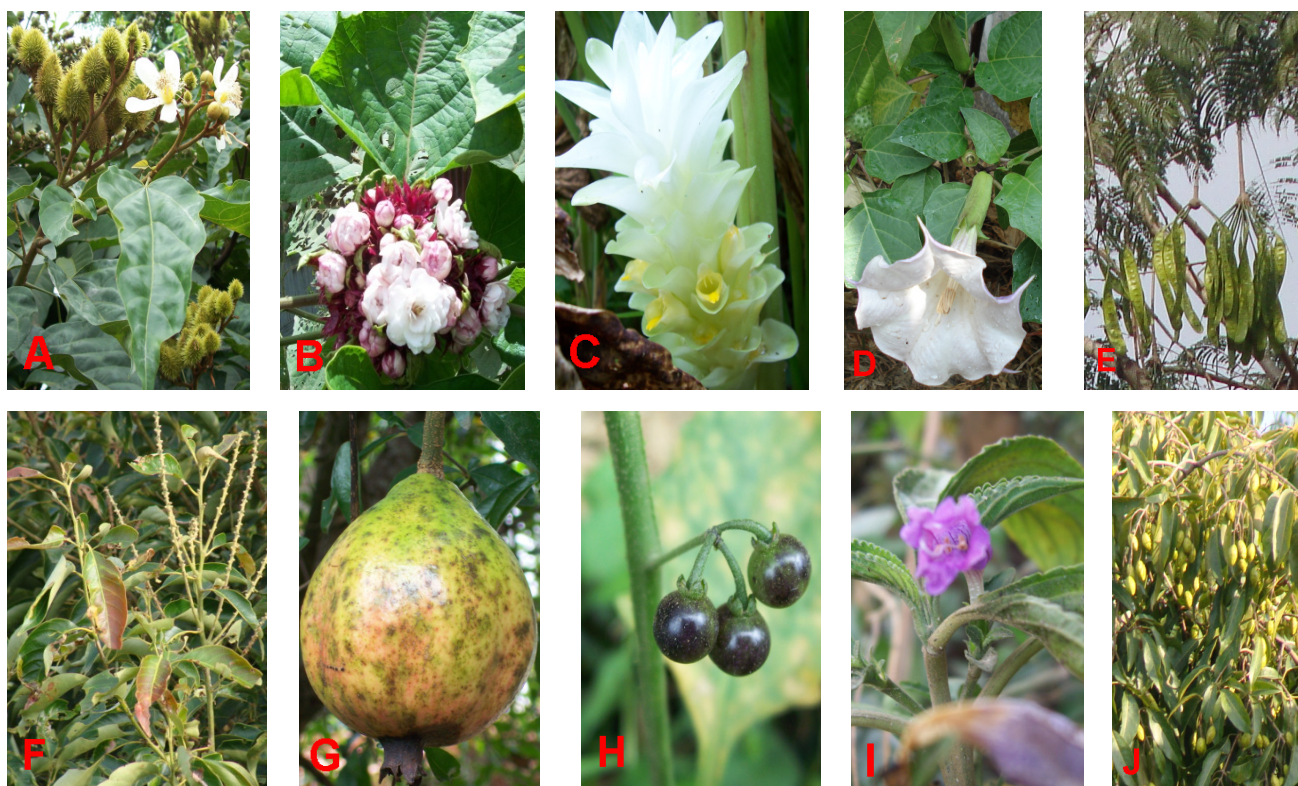
Fig. 1. Photographs of the dye yielding plants. (A) Bixa orellana , (B) Clerodendrum chinense , (C) Curcuma domestica , (D) Datura stramonium , (E) Parkia timoriana , (F) Lithocarpus pachyphylla , (G) Punica granatum , (H) Solanum nigrum , (I) Strobilanthes flacidiifolius and (J) Terminalia chebula

The ten plants taken for the experiment and their parts used are indicated in Tab. 1 and 2. The quantitative analysis of the ten selected plants with their respective secondary metabolites or pigments responsible for dyeing is given in Tab. 3. Bixa orellana recorded 163.11 mg g -1 of carotenoid pigment responsible for dyeing while curcumin content in Curcuma domestica , which is the pigment responsible for yellow to orange colour dye was found to be 27.7 mg g -1 . Total chlorophyll content of Clerodendrum chinense and Datura stramonium which is used to dye green colour was 10.29 mg g -1 and 11.83 mg g -1 , while that of chlorophyll a