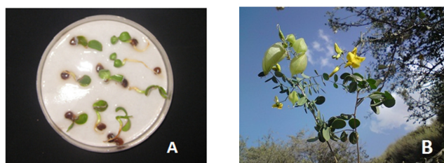
Fig. 3. Seeds germination in laboratory conditions (A) and mature shrub of Colutea bohsei Boiss. in habitat (B)

submersion in concentrated (98%) H_2SO_4 for 30 min and then ( GA_3 100 ppm 24 hr) resulted the best germination percentage (66.2%) under laboratory conditions (Tab. 2). Similar results by Nadjafi et al. (2006), showed that acid scarification by H_2SO_4 (75% v/v), for 5 and 10 min with GA_3 (1500 ppm, 48 hr), broke dormancy and induced 31.9% and 34.1% germination of T. polium , respectively. The best germination rates for laboratory conditions were 17.4 seeds in days which were determined in seeds soaked in concentrated (98%) H_2SO_4 for 30 min plus floating in GA_3 (100 ppm) for 24 hr (Tab. 2).