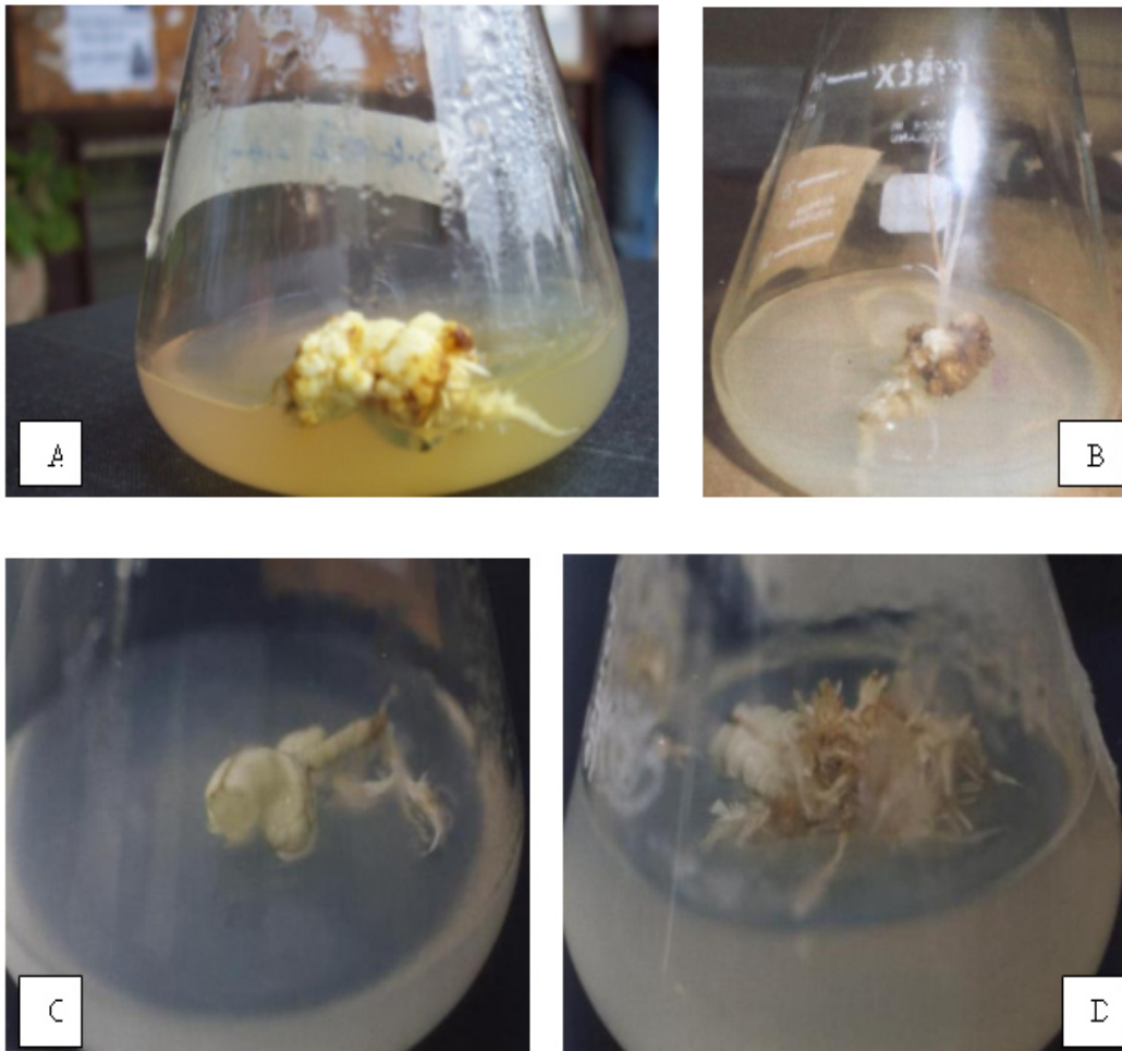
Plate 1. Responses of L. taraxacifolia leaf explants to MS medium supplemented with 2,4-D alone or in combination with Kinetin: A: leaf inoculated on MS+ 0.4mg/l 2,4-D showing roots; B: Plantlet generated on leaf explants inoculated on MS+ 0.5 mg l -1 kinetin and 0.1 mg l -1 2,4-D; C: Roots on leaf explants inoculated on MS+ 0.1mg/l 2,4-D and D: Roots on leaf explants inoculated on MS medium without growth regulators

Media containing Benzyl adenine (BA) together with NAA have been reported to be preferably used for multiple shoot induction and maintenance in Asteraceae plants (Stojakowska and Malarz, 2004). According to Trejgell et