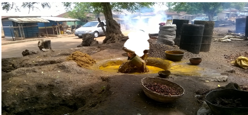
Figure 2. Ground-dug refining sludge pit from where POME was collected

To analyse the metals, 100 mL of POME sample was digested by heating with concentrated \text{HNO}_3 until the volume was reduced to 3-5 mL. This volume was made up to 10 mL with 0.1 N \text{HNO}_3 . The concentration of the metal was estimated by using an Atomic Absorption Spectrophotometer (Perkin Elmer Analyte A 200 model).