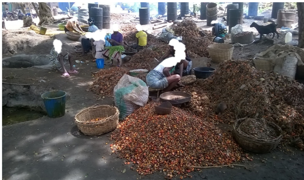
Figure 1. Processing of palm fruit in the local refinery from where POME was collected