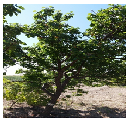
Fig. 2. Fruits, leaves and tree of genotype '50-K-91'