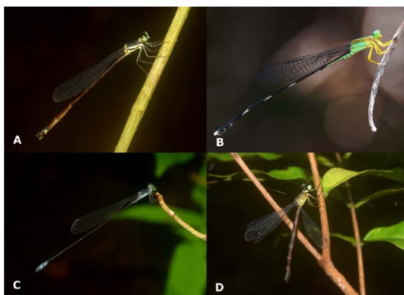
Fig. 1. A) Coellicia dinocerus (Laidlaw, 1925). B) Pandanobasis cantuga (Needham and Gyger, 1939; Villanueva, 2002). C) Teinobasis annamaijei (Hamalainen and Muller, 1989). D) Rhinagrion reihnhardi (Kalkman and Villanueva, 2011)

GD – Geographic Distribution; CS – Conservation Status; DD – Data Deficient; O – Oriental; A - Brgy. TandangSora, Governor Generoso; B - La Union, San Isidro; C - Brgy. Maputi, San Isidro; D - Catmonan, Mati City.