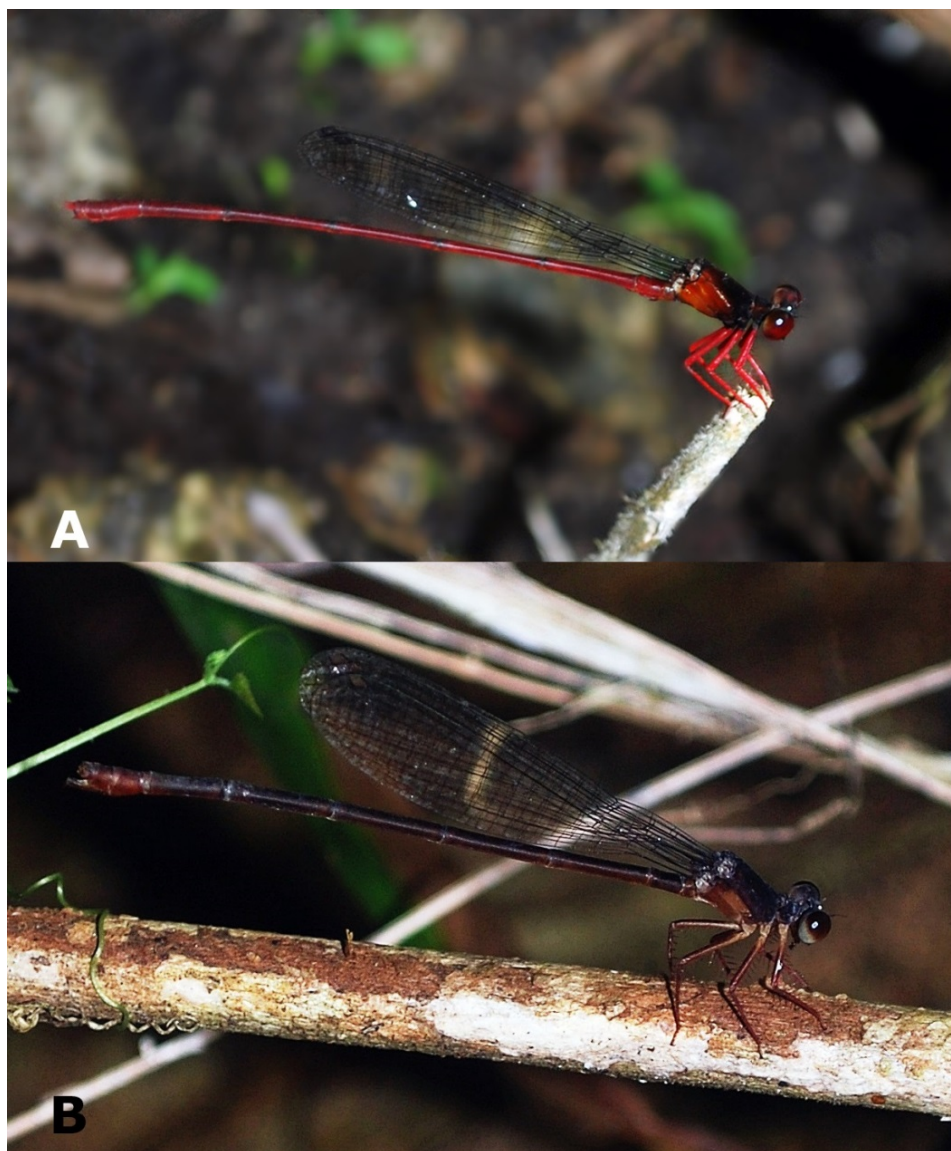
Fig. 4. A. Risiocnemis antoniae - male (Gassman and Hamalainen, 2002); B. Risiocnemis antoniae - female (Gassman and Hamalainen, 2002)