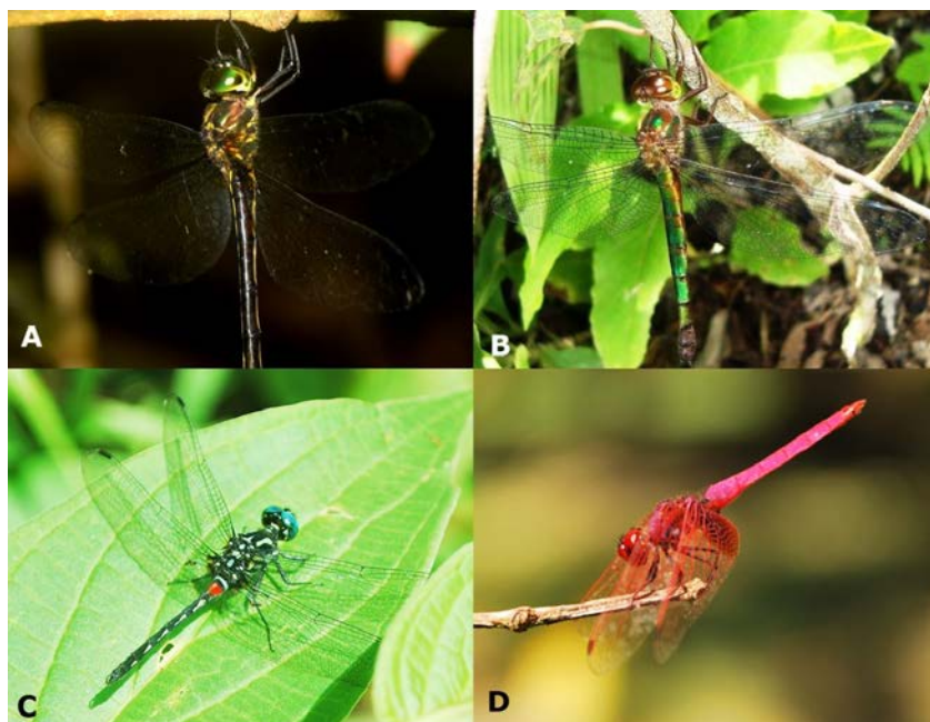
Fig. 2. A) Idionyx philippa (Ris, 1912). B) Heteronias heterodoxa (Needham and Gyger, 1937). C) Diplacina bolivari (Selys, 1882). D) Trithemis aurora (Burmeister 1839)

GD – Geographic Distribution; CS – Conservation Status; DD – Data Deficient; O – Oriental; A - Brgy. TandangSora, Governor Generoso; B - La Union, San Isidro; C - Brgy. Maputi, San Isidro; D - Catmonan, Mati City.