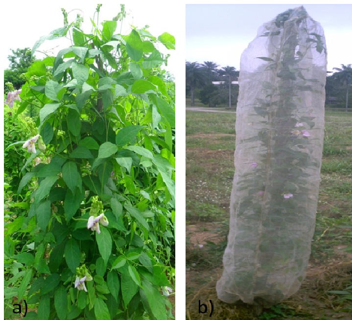
Plate 1. (a) African yam bean left to open pollination, and (b) a whole plant isolated with fine mesh transparent net

occurred in TSs117 under treatment A. TSs16 had the least vigor of 65% under the same condition of pollination (i.e. A). For plants within an enclosed bagging, 100% germination and vigour was obtained in TSs16, TSs39 and TSs89 (Table 5).