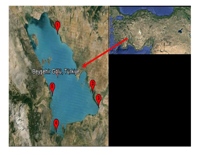
Fig. 1. Study area (Lake Beyschir) and sampling stations: 1. Tolca, 2. Ciftlik, 3. Beyschir Centre, 4. Yesildag, 5.Golyaka

Research on the range of the age indicated that the fish in the Lake Beyşehir showed an alteration between II and VII years of age (Table 3). The age distribution of